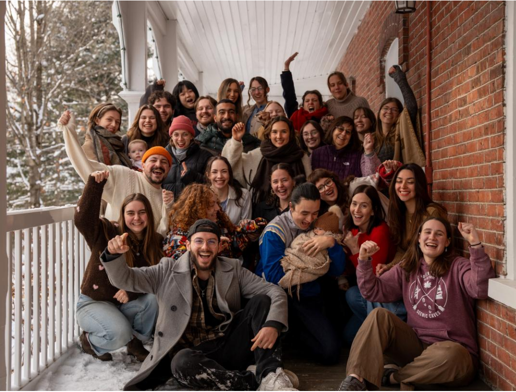
The class of the 2026 AMDTS! We are a whopping 21 students strong!

It has been 2 years since our last Arts and music Discipleship Training School, and with over double the number of students since our last AMDTS we are so excited to see what God has in store!