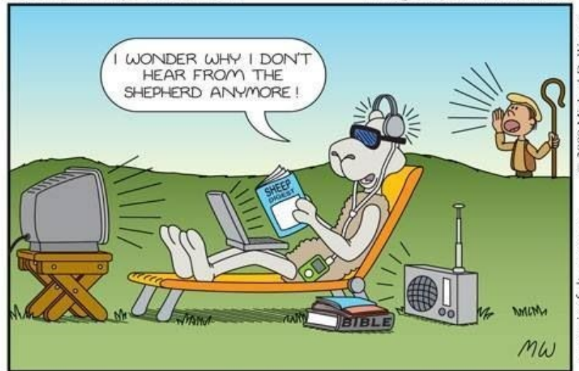
My sheep listen to my voice; I know them, and they follow me. - JOHN 10:27 NIV